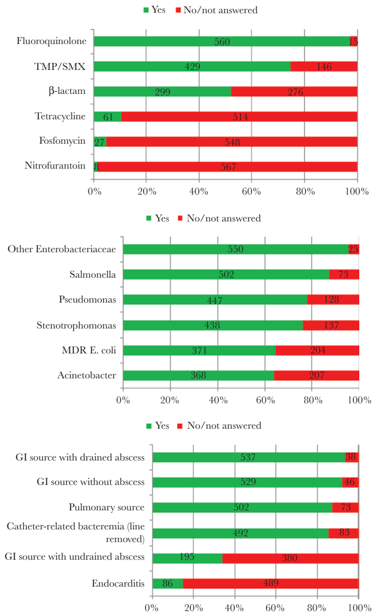
Figure 1. Patient vignette of a 36-year-old woman who presented with symptoms of acute pyelonephritis, who responded to initial intravenous antibiotics, and had Escherichia coli recovered in both blood and urine cultures, susceptible to all listed agents; N = 575. (A) Which of the listed oral agents would respondents feel comfortable transitioning to. (B) Would respondents be willing to use an oral antibiotic if the organism was not an E. coli , but rather ____? (C) Would respondents feel comfortable using an oral agent given the following sources of the Gram-negative bacteremia? MDR, multidrug-resistant; TMP/SMX, trimethoprim/sulfamethoxazole.

Gram-positive bacteremia exists. Agreement on transition to oral therapy in Gram-positive bacteremia appears most consistent in pneumonia (with bacteremia) caused by S pneumoniae . Based on small retrospective studies and a single randomized controlled trial, clinical practice guidelines for community-acquired pneumonia currently suggest that a “patient should be switched from intravenous to oral therapy when they are hemodynamically stable and improving clinically” [12–14]. In a recent study, a randomized clinical trial supporting transition to oral antibiotics in endocarditis was published. This study of